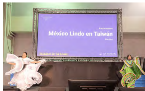
Mexican dance performance at the Cultural Festival of GIS 2023.

By hosting such high-quality international student symposiums, GIS Taiwan hopes not only to broaden the horizon of university students in Taiwan but also to leave a deep impression on the participants from abroad, increasing Taiwan's visibility in the world and letting it shine on the international stage.