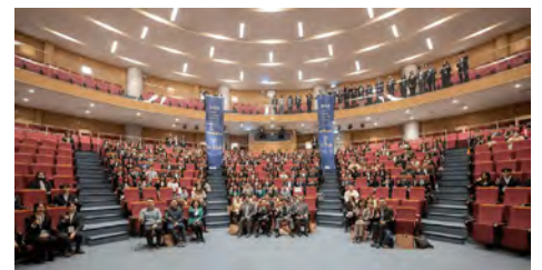
| Group photo at the opening ceremony of GIS 2023.