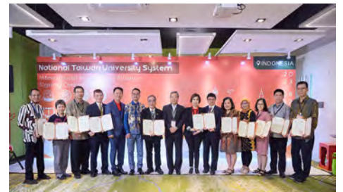
NTUS celebrated the MOU signing with 8 Indonesian high schools in Jakarta, Indonesia.