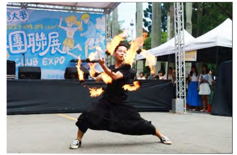
Fire Dance Club showcasing exquisite skills.

A total of 187 clubs, varsity teams, and administrative units contributed to the resounding success of 2023 Club Expo. The event also featured a second-hand book exchange booth and a social service section, with the intent of imbuing sustainability concepts and an altruistic spirit among the visitors. The booths remained bustling well into the afternoon until the Expo's stirring conclusion. We can't wait to see you at next year's Club Expo on Royal Palm Boulevard.