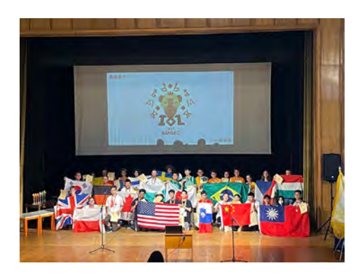
The 2023 International Linguistics Olympiad was held in Bansko. Bulgaria.

The year 2022 was a milestone; NTU's linguistics talents displayed remarkable teamwork and made exceptional achievements in the team competition. To qualify for the primary training, participants must emerge in the top 10%, with the subsequent stage grooming the top eight for the Asia Pacific Linguistics Olympiad (APLO). NTU's linguistics experts, aided by alumni and former Olympians, provided comprehensive training that went beyond theoretical knowledge, imparting the skills needed to unravel complex linguistic puzzles.