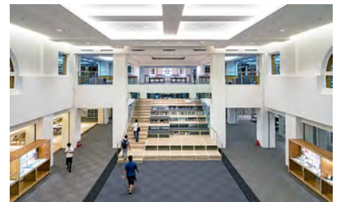
The new main staircase welcomes all readers with an uplifting visual impact; the see-through structure admits sunlight from the rear windows for enhanced lighting. The exhibition area is located above the staircase and the reading area is located below.