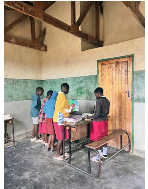
Children selecting the English books they want to read.