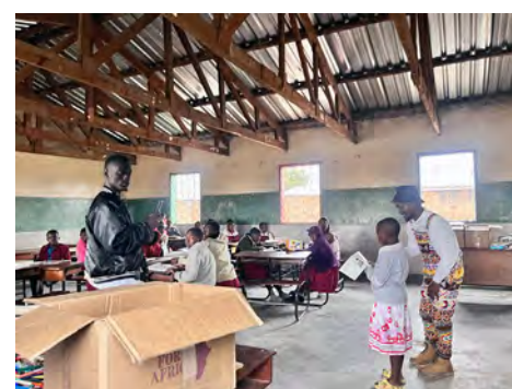
TIWACT team members brought many English books to Chiputula Primary School to conduct English reading workshops.