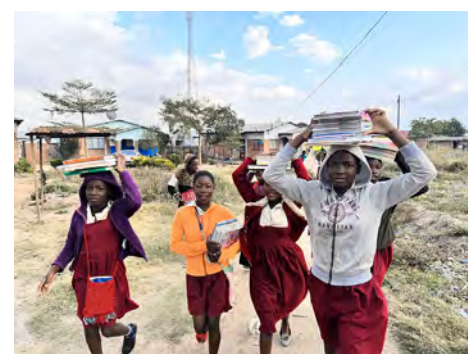
The goal of TIWACT is to enhance children's English reading abilities, aiming to contribute to the reduction of the dropout rate among Malawian students.