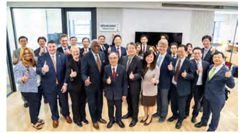
| Group photo at the unveiling ceremony.

NTU looks forward to further exchanges and collaborations among the three universities, mainly through joint projects, knowledge sharing in various fields, building an extensive platform for mutual learning, as well as hosting exchanges among partner faculty and students.