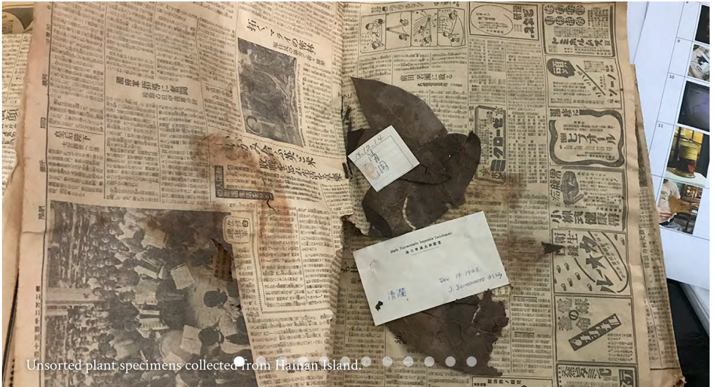
Unsorted plant specimens collected from Hainan Island.

Taiwan, located in the subtropical and tropical regions of the Western Pacific between the Ryukyu Islands of Japan and the Philippines, boasts rich and diverse landscapes. These geological features host unique biodiversity, catching the attention of early settlers and natural explorers from around the world. Westerners in the 19th century, followed by Japanese and Chinese scientists in the 20th century, were amazed by the vibrant ecology of this small island, leaving behind extensive records and natural history specimens. For nearly a century, NTU has acquired books, instruments, and specimens to support teaching and research, as well as setting up department-specific specimen rooms.