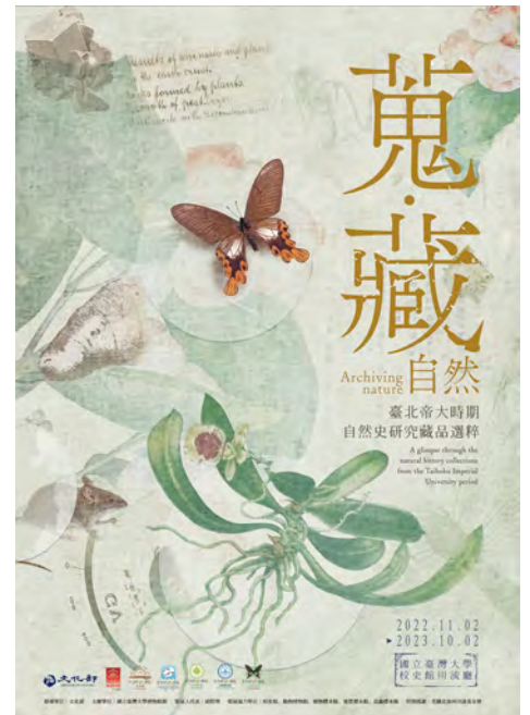
The illustrated theme poster of the exhibition.

In November 2022, with funding from the Ministry of Culture, the 11 units of the NTU Museum Group -- University History, Anthropology, Physics, Geology, Entomology, Agriculture, Zoology, Botany, Archives, Medicine, and Arts-- collaborated to curate "Archiving Nature: A Glimpse through the Natural History Collections from the Taihoku Imperial University Era (the forerunner of NTU