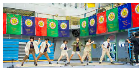
Vibrant student performance energizes the ceremony.