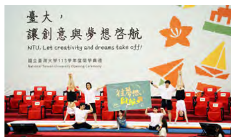
Exciting student performance inspires everyone at the ceremony.