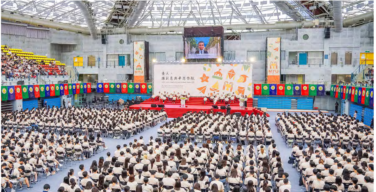
| NTU 2024 Opening Ceremony.

Spotlighting the theme “NTU: Where Creativity and Dreams Take Flight,” the 2024 opening ceremony at National Taiwan University (NTU) encouraged the incoming students not just to develop their skills and knowledge during their academic journey but also strive to make a positive impact on society.