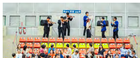
In a break with traditional stage performances, the NTU Chinese Orchestra (right) and the NTU Symphony Orchestra (left), engage in a thrilling musical duel from the audience seats, garnering widespread hearty applause.