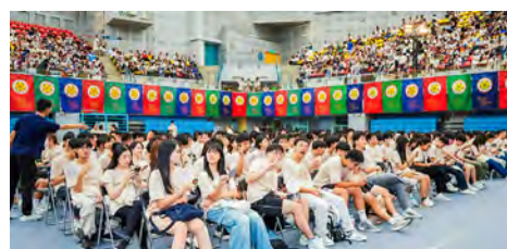
New students and their families show excitement and enthusiasm at the opening ceremony.