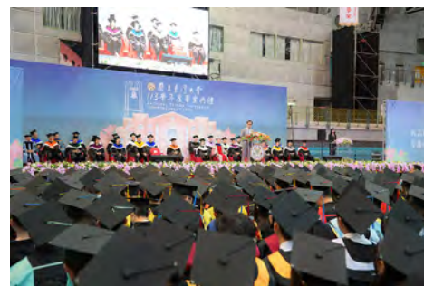
A glimpse of the graduation ceremony.

“In both good times and hard times,” she said, “let the efforts we make today become the light that leads us forward. Embrace the future with hope, and walk bravely into your bright tomorrow.”