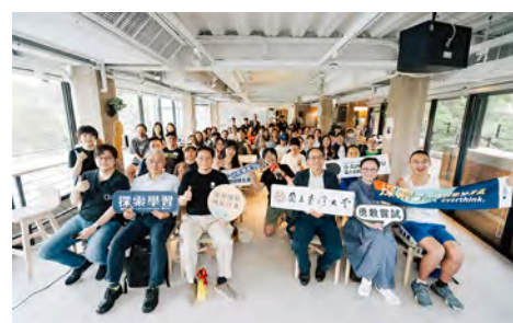
Exploratory Learning sharing session: Listening to what this generation of students truly needs.