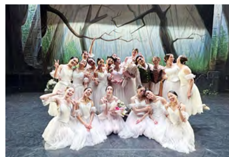
Exploratory Learning students performing with a Canadian ballet company.