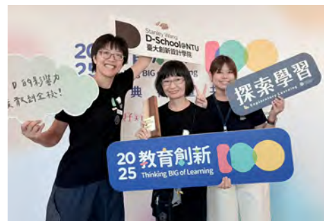
NTU D-School’s Exploratory Learning Program named as Parenting Magazine’s Top 100 Education Innovations.