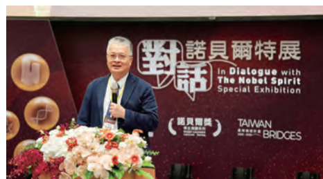
Vice Minister of Education Kuo-Wei Liu expressing his hope that the exhibition will inspire deeper and longer-term academic collaboration between Taiwan and Sweden.

Organizers intend that the exhibition will serve not only as a tribute to Nobel history, but also as a living platform for reflection on the values of curiosity, perseverance and intellectual courage that continue to shape the pursuit of knowledge today.