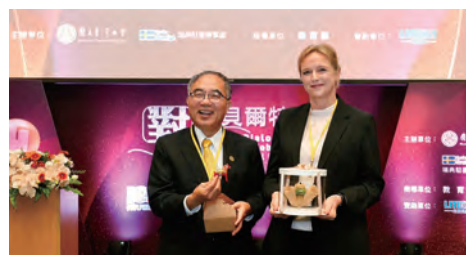
Representatives from both sides exchange commemorative gifts.