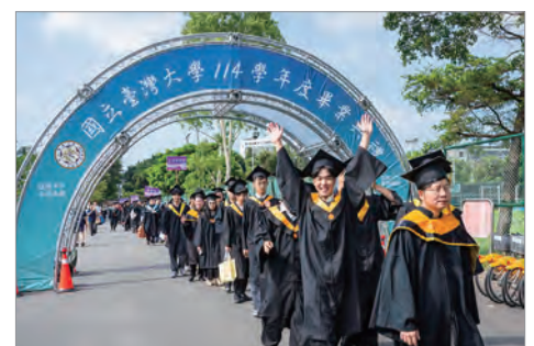
Campus farewell procession celebrating the graduates as they embark on their next journey.