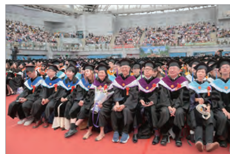
| NTU Commencement, Academic Year 2025–2026.