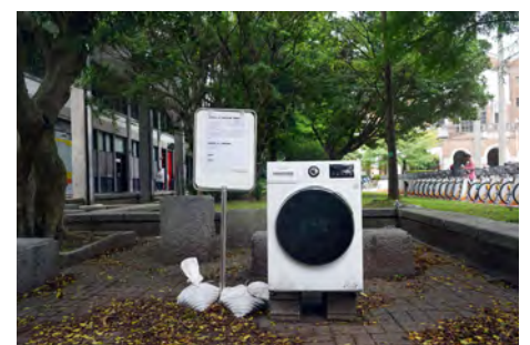
| Society as a Front-loading Washing Machine.