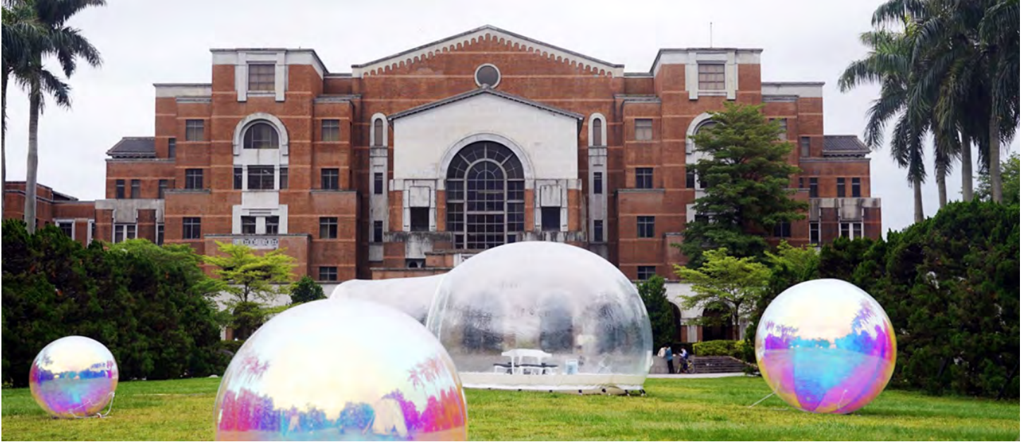
| The art piece Inside-out , a large transparent plastic sphere, displayed in front of the school library.