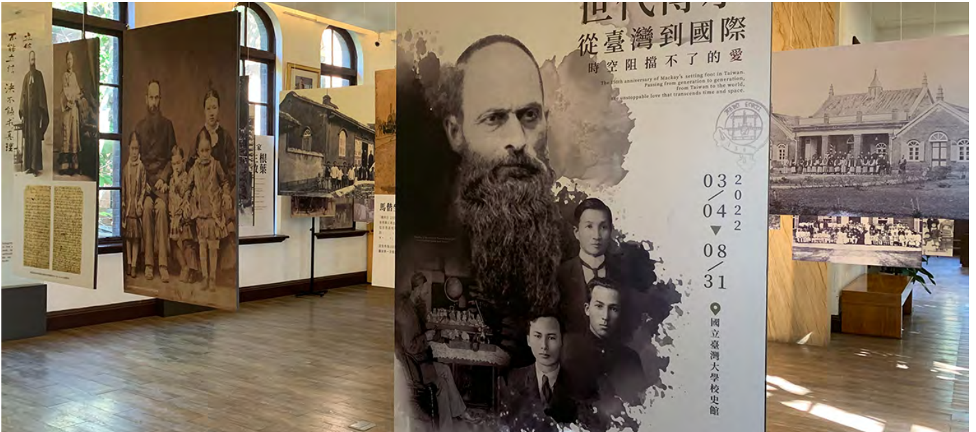
| Entrance to the exhibition on the second floor of the Gallery of National Taiwan University History.

150 years ago, a divine thread drew a Canadian missionary, George Leslie Mackay, across the ocean to Formosa, the island beautiful, blessed with God's love. He landed in Tamsui on March 9, 1872, with an aim to spread Christianity, practice medicine, and promote education in Taiwan. In order to commemorate the sesquicentennial of George Leslie Mackay's arrival in Taiwan, the Gallery of National Taiwan University History is holding an art exhibition in observance of "150th Anniversary of George Leslie Mackay's Setting Foot in Taiwan: From Generation to Generation, from Taiwan to the World, Love that Transcends Time and Space," from March 4 to August 31.