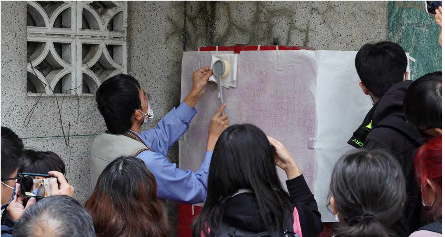
| Demo session of the 2022 Stone Rubbing and Cultural Asset Preservation Workshop.

Ever since its inception, the Summer College at NTU has been dedicated to equalizing education and minimizing the learning gap to realize educational justice. After 4 years of hard work, it has connected with over 70 partner schools all over Taiwan to offer over 125 general education courses. In the meantime, it has created diverse, flexible, and spontaneous learning fields by offering quality courses with different topics. In the future, the Summer College aspires to build on the present program and enrich the courses with further collaborations, allowing faculty members and students from all over Taiwan to learn and grow together in new environments with infinite possibilities.