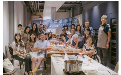
The food-sharing session of Summer College's student reunion.