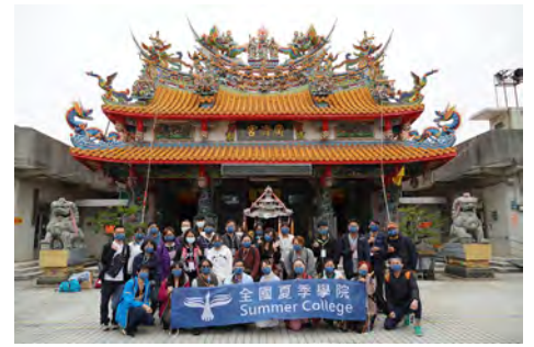
Group photo of the 2022 Stone Rubbing and Cultural Asset Preservation Workshop.

Click or Scan the QR code to explore the courses and activities organized by the Summer College.