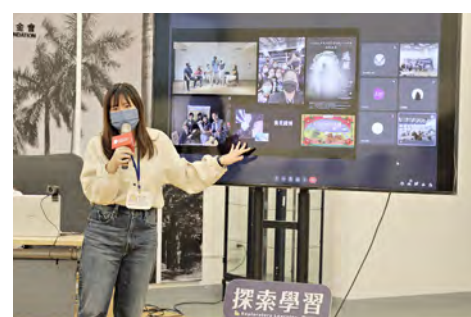
| A participant sharing her journey in music creation.