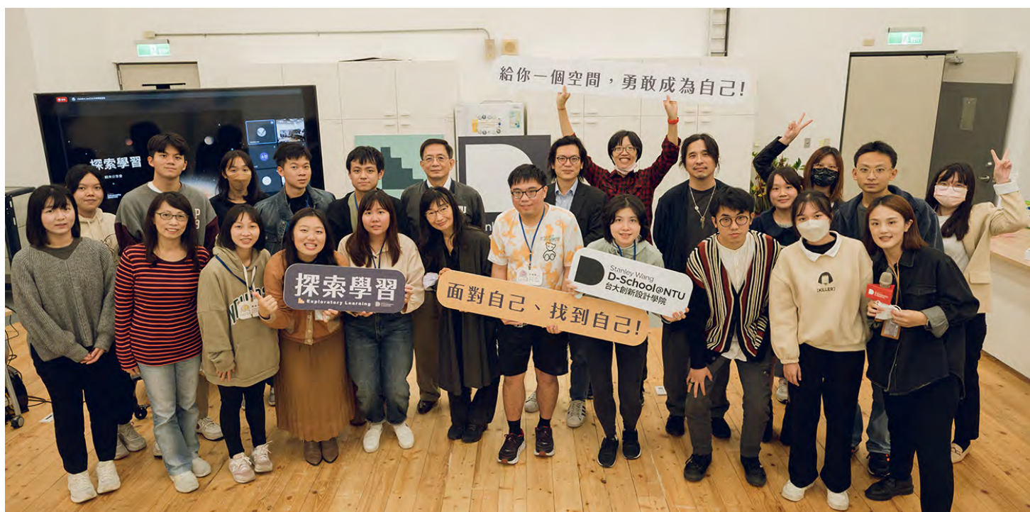
| Group photo of the students participating in the end-of-term sharing session of the Exploratory Learning Program.

D-School's Exploratory Learning Program is one of several Future NTU action plans. NTU is the first university in Taiwan to give academic credits for exploratory learning, creating space and flexibility for students to find their interests. Students who enter the Exploratory Learning Program retain their student status while making the most of NTU's resources to discover infinite possibilities on and off campus. Since its launch in 2021, the program accepted 36 students from nine colleges as of 2022, with 17 faculty members offering support and guidance along the way.