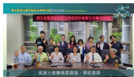
| Group photo of members on the Organizing Committee and Academic Committee.