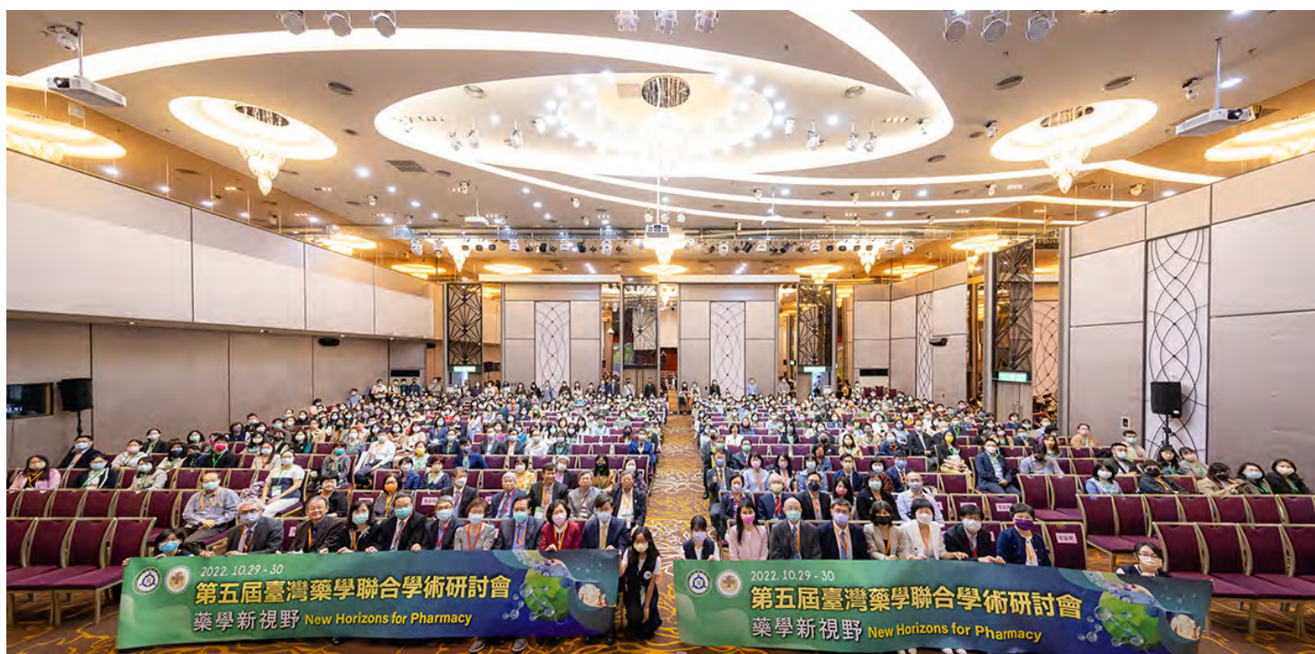
| Group photo of the participants of the 5th Taiwan Joint Conference of Pharmacy and Pharmaceutical Sciences.

The Taiwan Joint Conference of Pharmacy and Pharmaceutical Sciences is a grand annual event of the pharmaceutical industry, organized jointly by the Pharmaceutical Society of Taiwan and Taiwan Society of Health-System Pharmacists. In 2022, the NTU School of Pharmacy and NTU Hospital's Department of Pharmacy had the honor of co-hosting the event, and the 12 major professional pharmaceutical organizations were also invited as co-organizers. Many prominent professionals in the pharmaceutical field gathered for the academic exchange with expectations to encourage collaboration among pharmaceutical organizations and, most importantly, advance the development of pharmacy and the pharmaceutical professions.