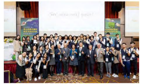
Post-conference group photo of the organizers and hosts.

Five sub-topics were discussed on the second day of the conference, each of which was specialized yet resonated with each other while responding to the conference theme. The spotlighted goals included applying precision medicine to innovative pharmaceutical services through pharmaceutical science and drug development, and promoting the expertise and efficacy of pharmacy through competency-oriented education. Last but not least, the conference hoped to revolutionize the environment in which pharmacists practice through research on the effectiveness of pharmaceutical care and health policies, opening up a new vision of pharmacy development.