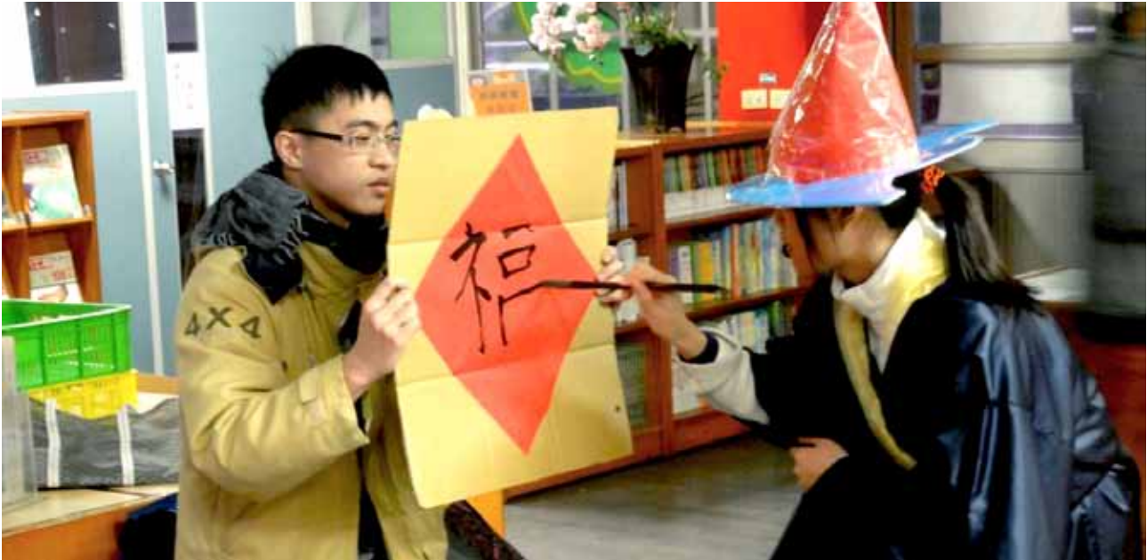
▲ Prof. Chiang's team demonstrates that SSEA-1+ pulmonary cells are Two NTU Star Rain members play dress up with their student in order to teach daily tasks.