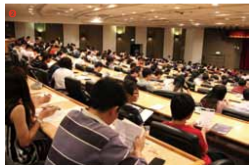
1 2 Dr. Shuji Nakamura, the 2014 Nobel Prize in Physics laureate, presents his lecture at the GIS NTU Convention Center.

bottlenecks he encountered in his mission to create the bright blue sensation. He also discussed how the tiny creations of the laboratory lead to major turning points in the development of modern society. The incredible advances he accomplished in epitaxy quality as well as his invention of a method for p-type doping of gallium nitride are now recognized as the most significant breakthroughs in the history of solid-state lighting technology.