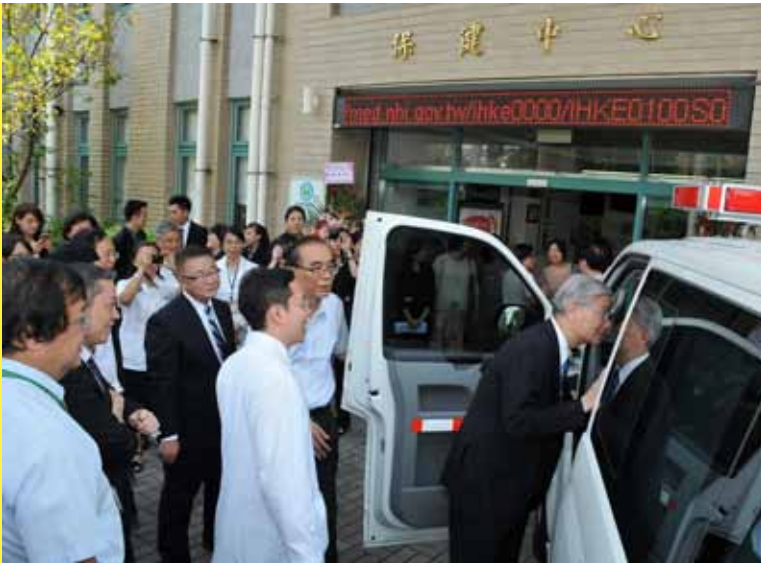
◀ The ceremony marking Breeze Charity Foundation's donation of a new ambulance takes place at the NTU Health Center.