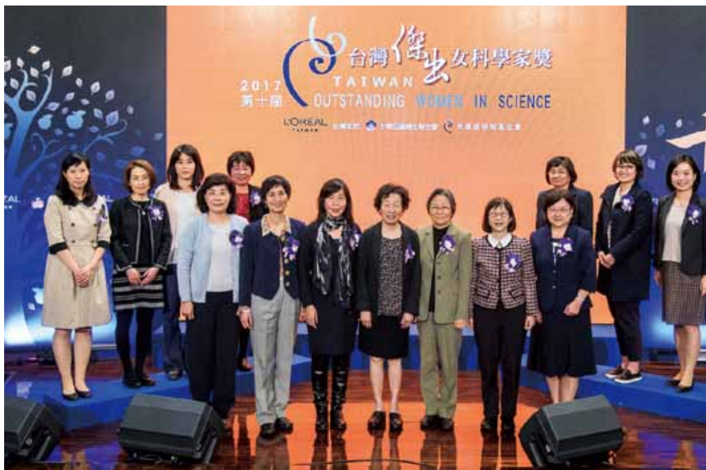
▲ Previous recipients of the Taiwan Outstanding Women in Science Award take part in this year's awards ceremony.