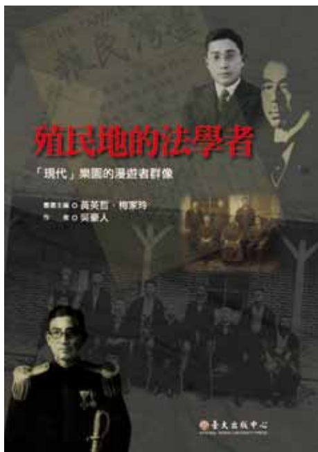
▲ The cover of the new book Wandering the Modern "Paraíso": Portraits of the Jurists in Colony