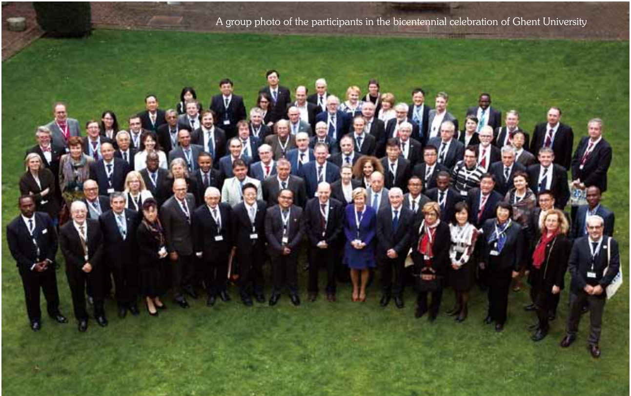
A group photo of the participants in the bicentennial celebration of Ghent University

technology complement one other would be a challenge universities must confront.