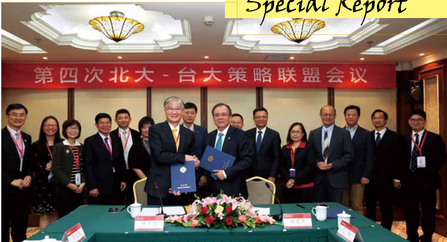
▲ A strategic partnership meeting on NTU Day@PKU