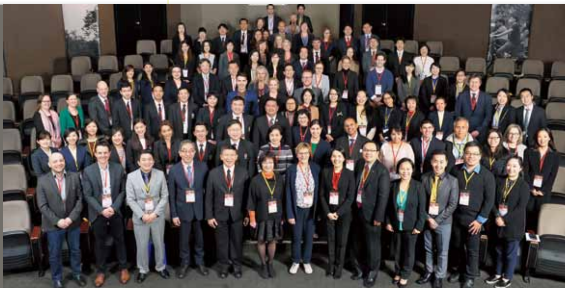
A group photo of participants in Partner Day 2017: Now To U@NTU