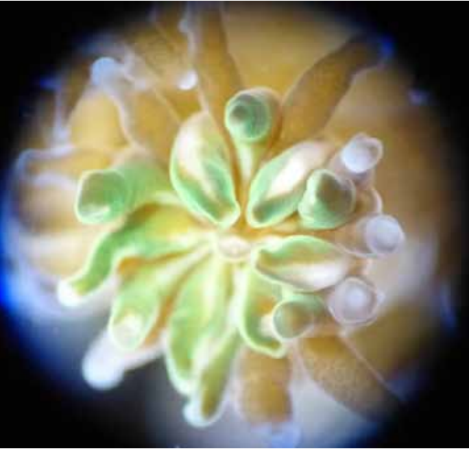
▲ Coral under the microscope

The 2017 International Ecology and Diversity Joint Field Course was hosted by the University of the Ryukyus in Okinawa, Japan during July 28 to August 6. Besides students and faculty members of the Japanese host university, participants in the 10-day summer program also included six students and faculty members from Thailand's Prince of Songkla University, three from Indonesia's Bogor Agricultural University, six from Taiwan's Tunghai University, and five from the NTU College of Life Science.