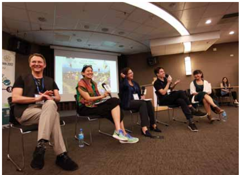
▲ The BXAI program drew more than 117 young scholars from 17 different countries to the NTU campus.