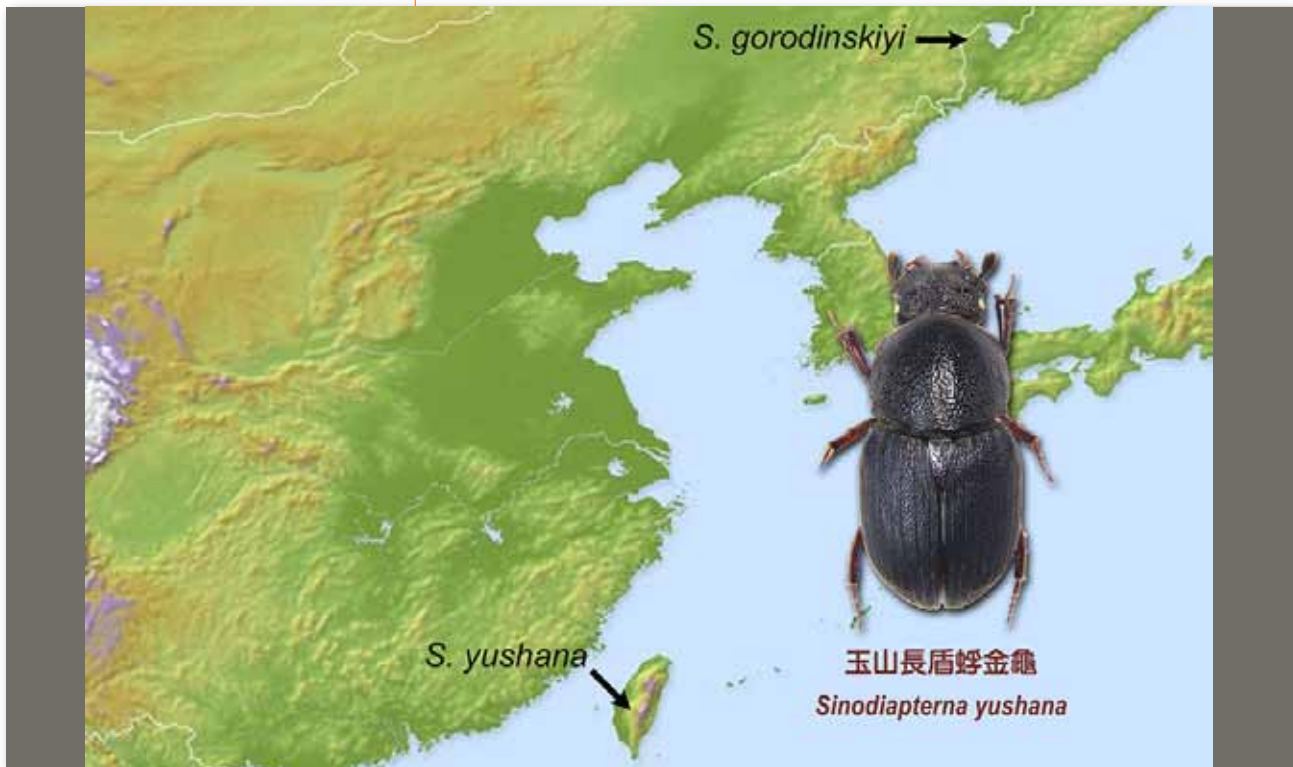
▲ A distribution map for the Sinodiapterna yushana