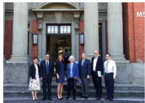
▲ The members of the CEPH evaluation team pose for a photo in front of the Administration Building.