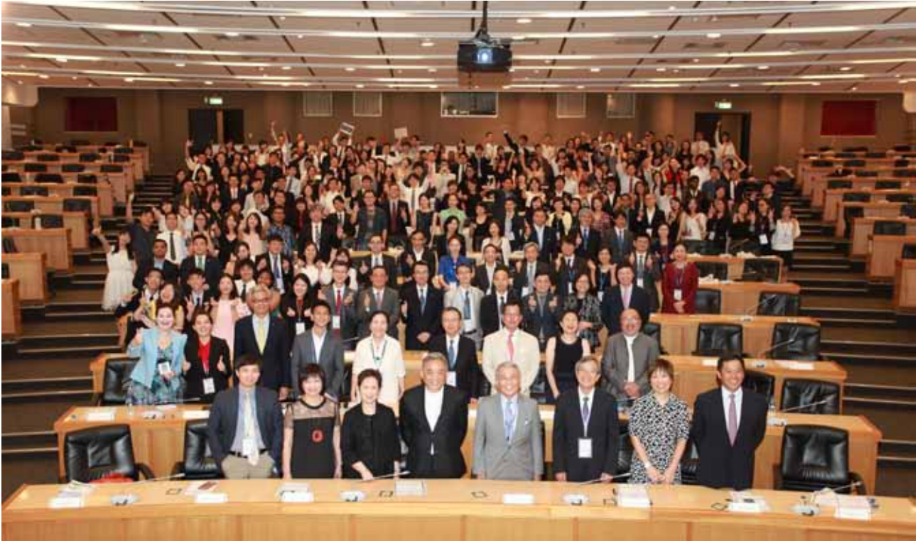
▲ The closing ceremony of the 2017 BXAI Summer Program takes place at GIS NTU Convention Center.

and begin building comradeship. Presented with team challenges and tasks, including plowing a garden, sanding wood, and climbing trees, the BXAI students had the opportunity to step outside of the classroom and get hands-on experience while developing a connection with the environment.