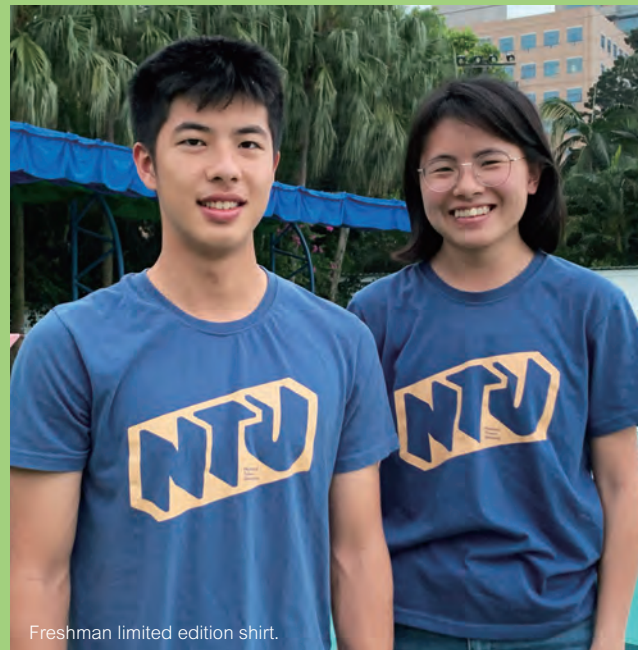
Freshman limited edition shirt.

The designer of the winning 2018 freshman limited edition shirt was Yu-Zhi Lin. Lin used a brick-piling image to create the word NTU on the shirt—each freshman is like a brick, and by means of peer collaboration and knowledge accumulation, the students eventually construct their respective knowledge systems during their four years at college. Bricks are also the most distinctive building material on the NTU campus. Particularly remarkable are the brick main gate built during the period of Japanese rule and the 13-groove ribbed tile exteriors of the historic buildings that flank the two sides of the Royal Palm Boulevard.