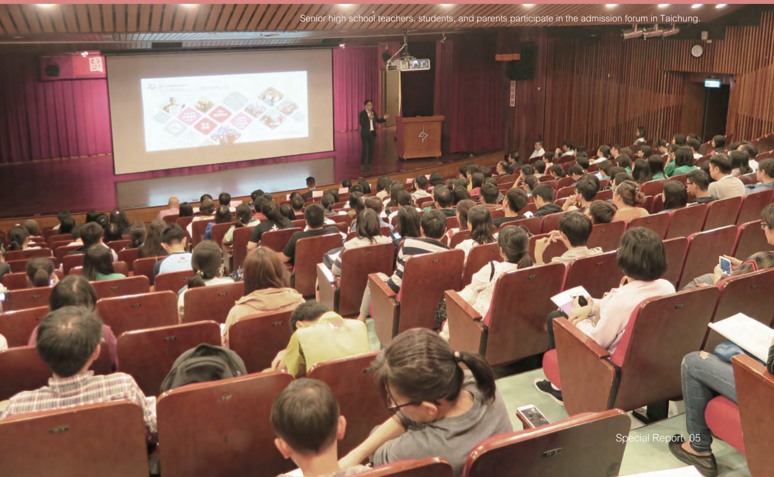
Senior high school teachers, students, and parents participate in the admission forum in Taichung.

NTU will host two more admission forums for students in northern and southern Taiwan, respectively, to introduce NTU’s offerings, resources, and environment to a wider audience. The school leaders hope that all high school students will come to realize that NTU not only offers students a chance to prosper in Taiwan but also opens doors for them to explore the infinite opportunities of this world.