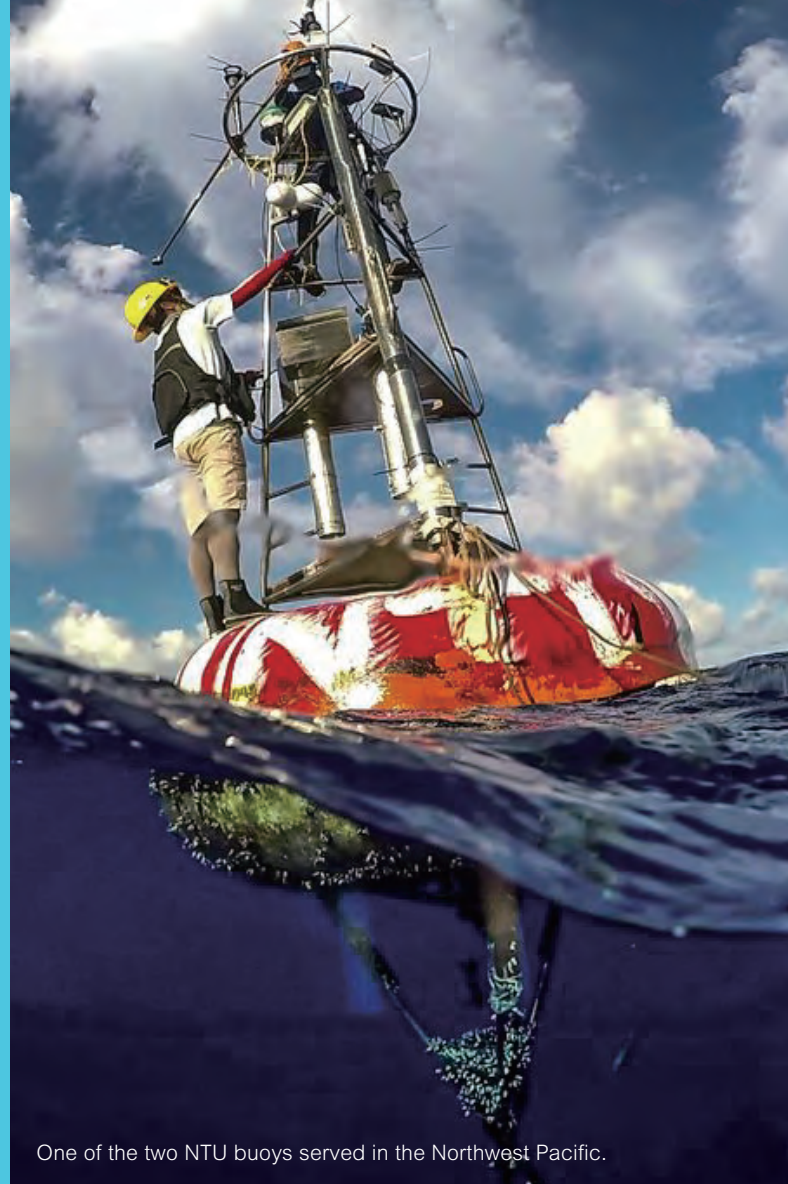
One of the two NTU buoys served in the Northwest Pacific.

As early as the 1970s, scientists had found that a warmer sea surface generally provides more energy for typhoon development. The window to determining whether the water surface is warm enough to generate sufficient energy to produce a typhoon is as short as 10 hours. Scientists have struggled with the problem of insufficient data to grasp the needed temperature change. Now, the two NTU buoys have provided answers by revealing how air and sea interact at critical moments. This important cross-disciplinary study thus contributes significantly to timely warning, accurate forecasting, and improved disaster mitigation with respect to typhoons.