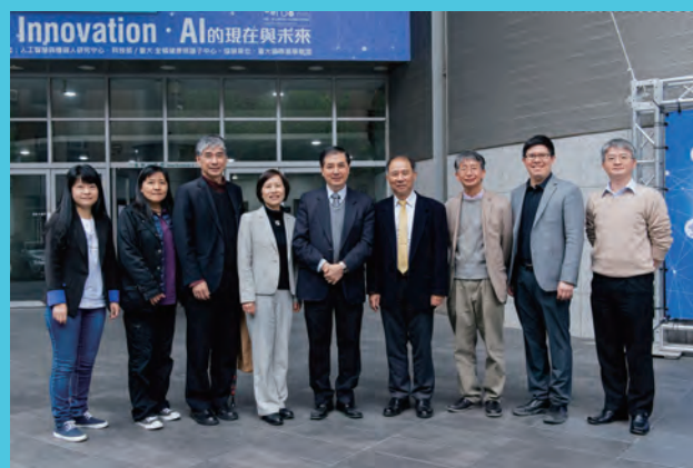
Members of the NTU Center for AI and Advanced Robotics pose for a group photo.

In the afternoon, the 20 research teams at AIROBO participated in a poster show-and-tell event, where visitors could interact with real robots. It also provided a rare opportunity for scholars from various departments to conduct interdisciplinary discussions. The wide-ranging and groundbreaking research results demonstrated that the research center has been an effective incubator in the fields of human-computer interaction, mechanical design, machine learning, deep learning, etc., and that the most salient results can be applied in such areas as cognitive psychology, industrial manufacturing, and biomedicine. No doubt, the center’s multidisciplinary nature will broaden NTU’s vision and boost its competitiveness in the future world of AI.