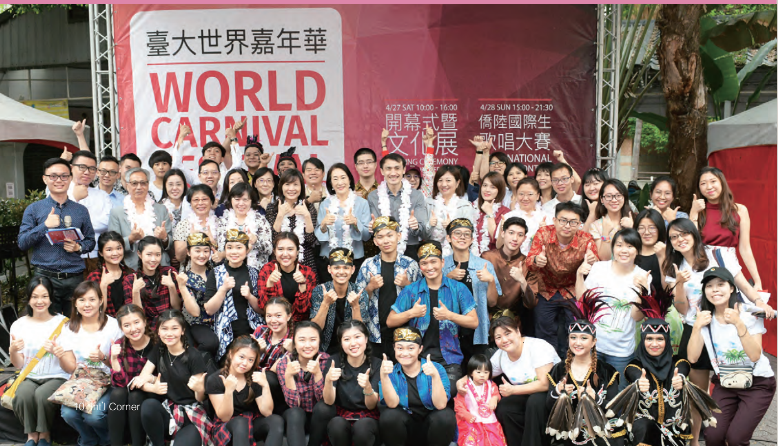
Group photo of the honored guests and performers.

As the singing competition drew to a close, so did the 2019 Break & Fuse Festival. But don't worry, we expect to see you there next year!