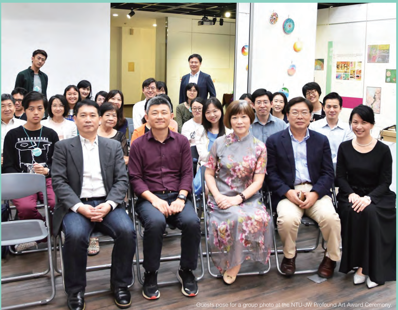
Guests pose for a group photo at the NTU-JW Profound Art Award Ceremony.

The collaboration between the NTU Library and the NTU Center for the Arts brought together books and artworks, librarians and artists. By working together, the library and the center effectively pooled resources and created new synergy. The participating artists were surprised that the library had such a large collection of art books, and the librarians also gained new perspectives by working with the artists. This exhibition of artworks and art books marked a richly successful cross-departmental collaboration on campus, and it attracted many people to appreciate the beauty of these works.