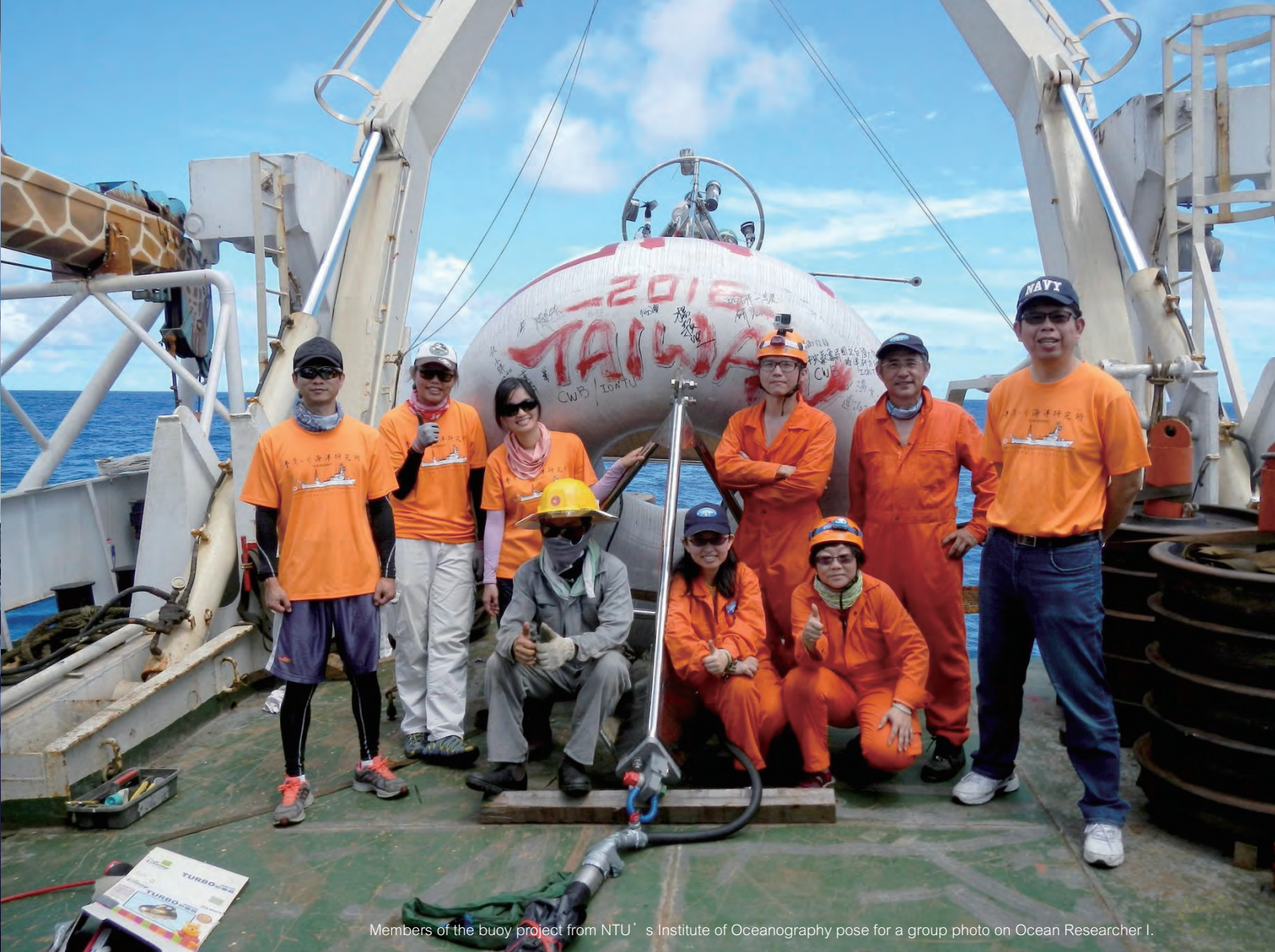
Members of the buoy project from NTU's Institute of Oceanography pose for a group photo on Ocean Researcher I.

Accurate typhoon forecasting requires more than a full understanding of the physical interaction between air and sea. It also needs constant feeds of atmospheric and oceanic in situ data into computer models, as well as regular verifications and modifications. Technical developments and satellite remote sensing have contributed significantly to the accurate prediction of typhoon direction. However, the forecast of typhoon intensity remains a challenge because there are insufficient observations of sea-air exchanges. On the one hand, sending research vessels or instruments to the deep blue sea to await typhoons or chase typhoons is like sending mice to attach a bell to a cat—an impossible mission. On the other hand, if we could deploy anchored buoys in selected areas to “wait for” typhoons, measure and assess the key metrics with advanced sensors, and rapidly transmit the data to land-based labs for forecasting and analysis, it would be far safer and more effective. Unfortunately, buoys that can precisely measure