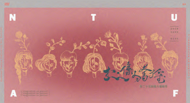
2019 NTU Art Festival.