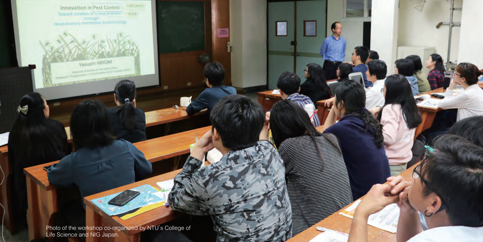
Photo of the workshop co-organized by NTU's College of Life Science and NIG Japan.