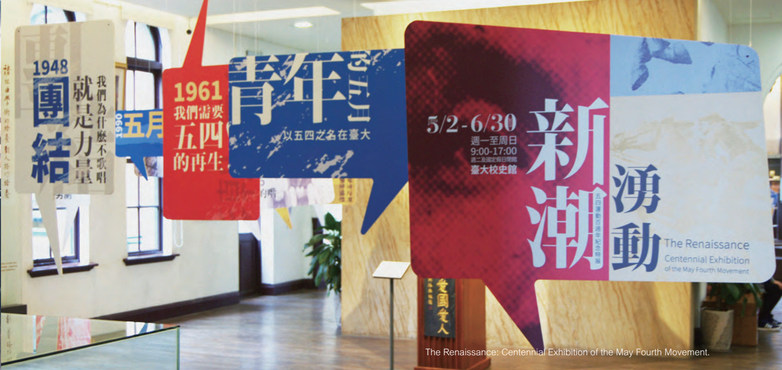
The Renaissance: Centennial Exhibition of the May Fourth Movement.

Literature Department, who was also a crucial figure in the May Fourth Movement.