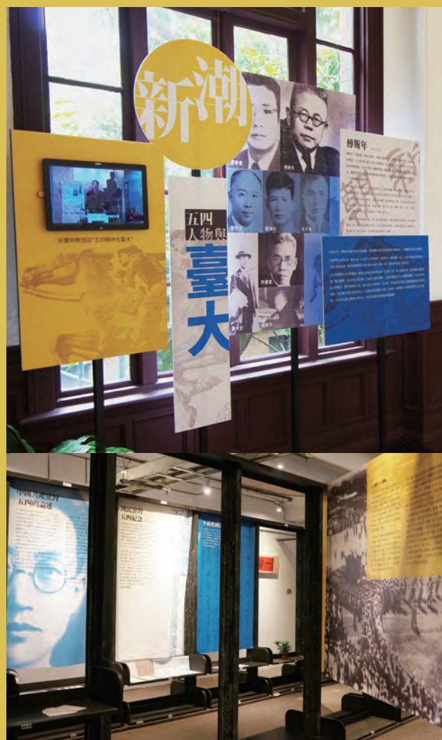
The Renaissance: Centennial Exhibition of the May Fourth Movement.

The Centennial Exhibition of the May Fourth Movement was launched on May 2, and it will continue until June 30 at the Gallery of NTU History. Visitors are welcome to visit during opening hours. (The Gallery is closed on Tuesdays and national holidays.)