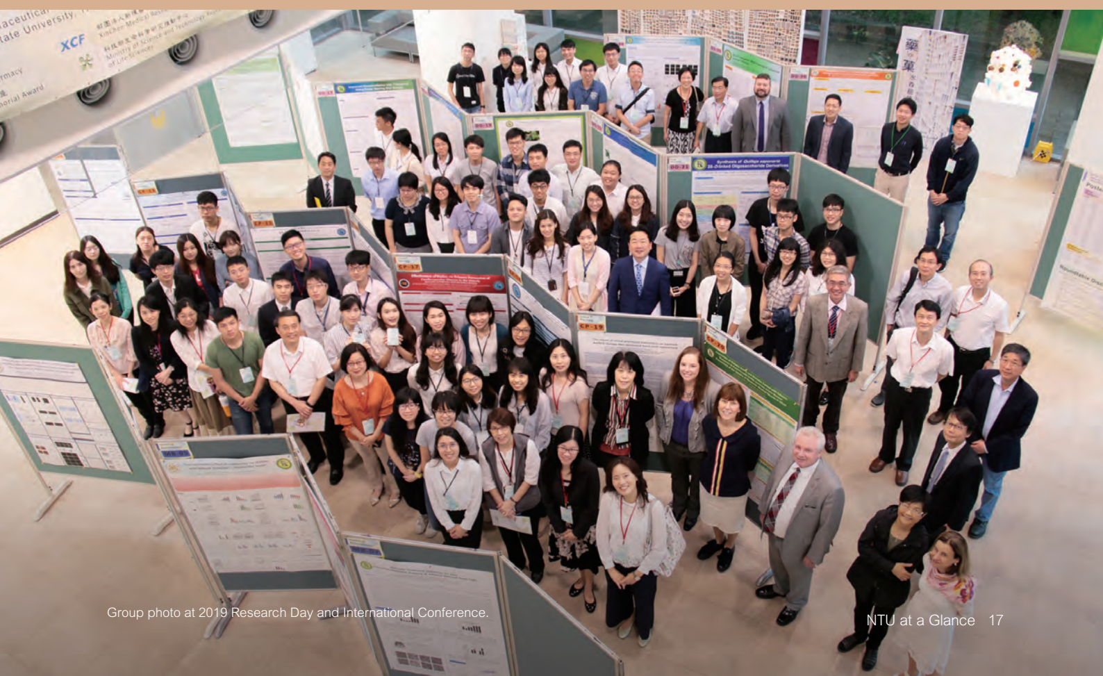
Group photo at 2019 Research Day and International Conference.

The 2019 Research Day and International Conference included a thesis contest, round table symposium, and keynote speeches, allowing NTU students and guests with many opportunities to exchange ideas and foster academic cooperation. The event was made possible thanks to the generous support of XinChen Medical Research Foundation, Professor Russel Rhei-Long Chen Memorial Award-Elite Scholarly Fund, and the Ministry of Science and Technology's Research Promotion Center of Life Sciences.