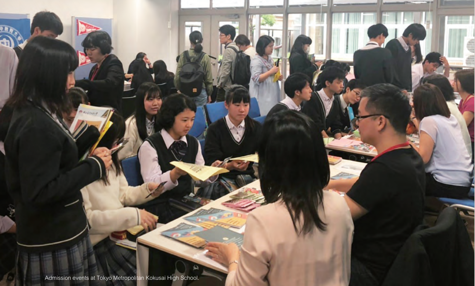
Admission events at Tokyo Metropolitan Kokusai High School.