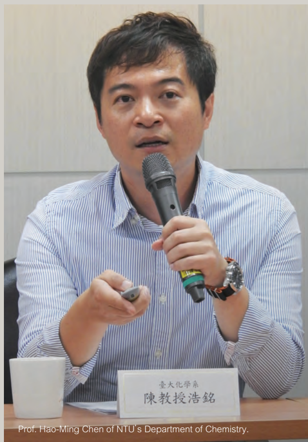
Prof. Hao-Ming Chen of NTU's Department of Chemistry.

NSRRC's TLS and SPring-8 facilities have made significant contributions during the past two decades. The Operando X-ray absorption spectroscopy is also broadly applied in the field of catalysis and electrochemistry in order to understand substances' electronic and atomic structures during chemical reactions. Chen utilized this technology to demonstrate the crucial role of single-atom iron catalysts in improving the conversion efficiency of CO 2 reduction. The findings of this research not only offer insights to renewable energy but are also of great potential commercial value.