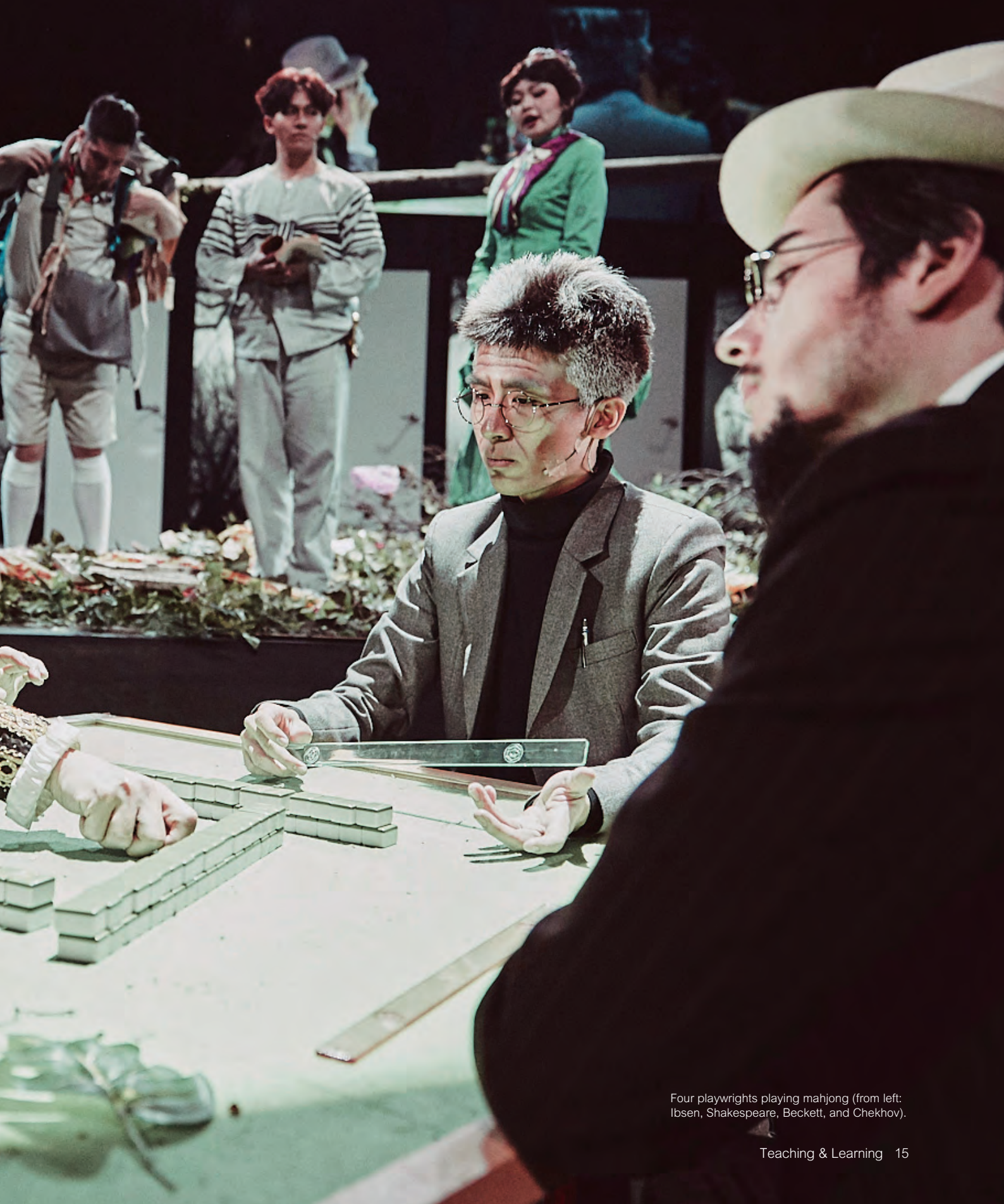
Four playwrights playing mahjong (from left: Ibsen, Shakespeare, Beckett, and Chekhov).