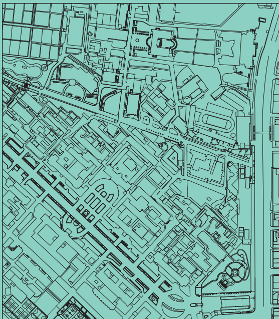
National Taiwan University Map

18 2019 Young Out Expo Invites Youth to Go on a Journey of Self-Exploration