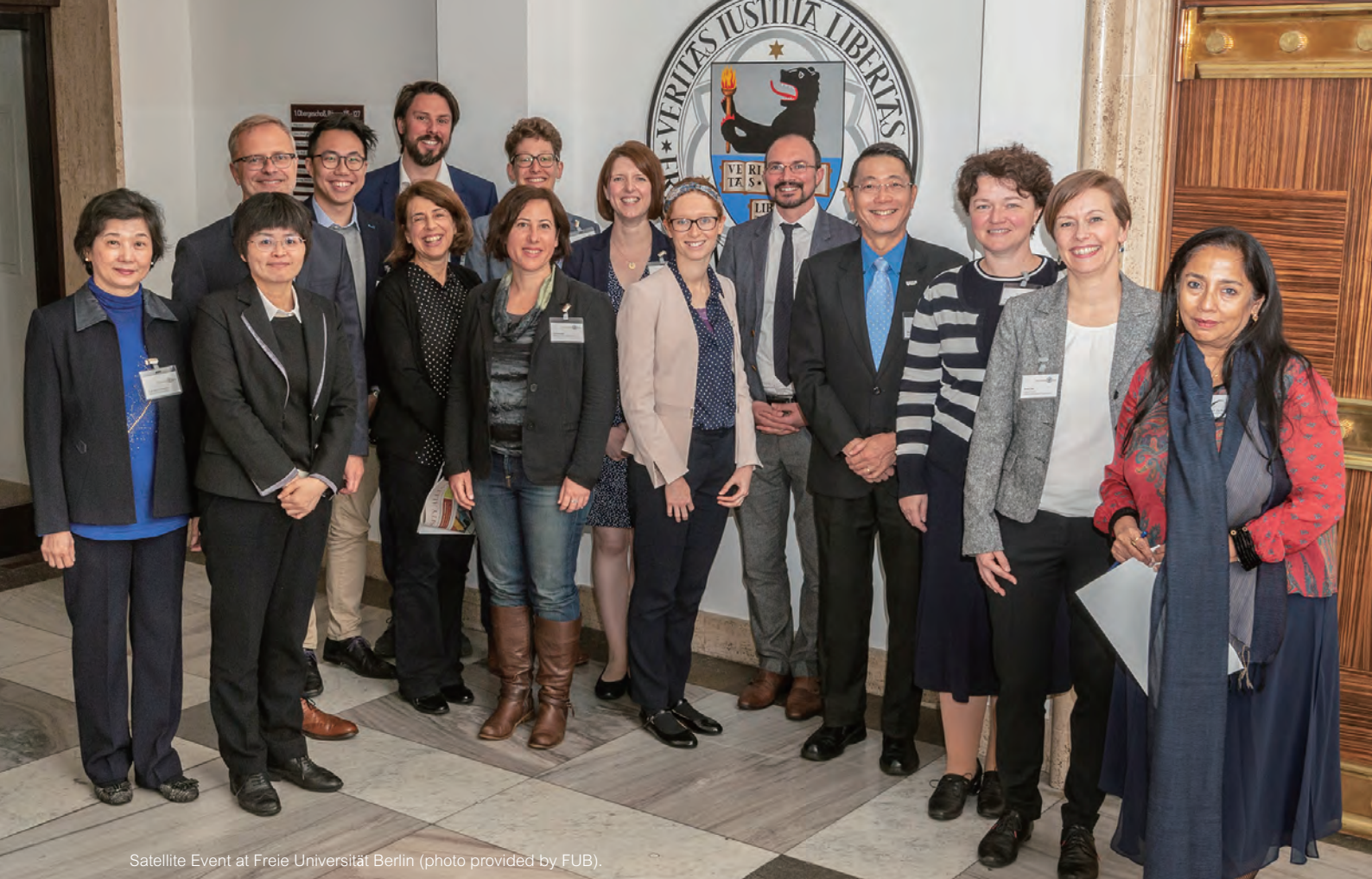
Satellite Event at Freie Universität Berlin.