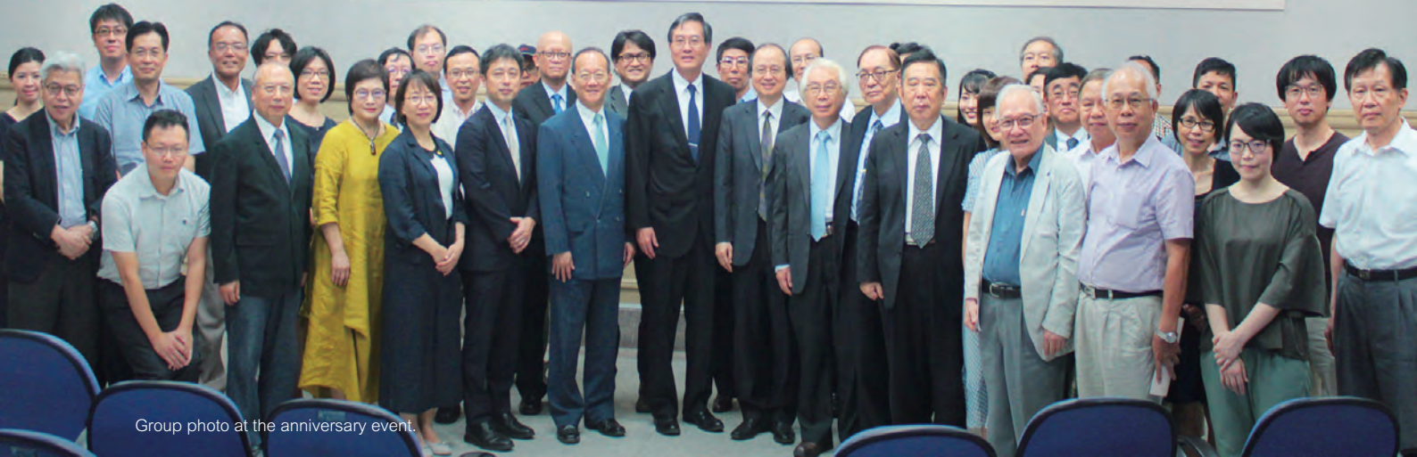
Group photo at the anniversary event.