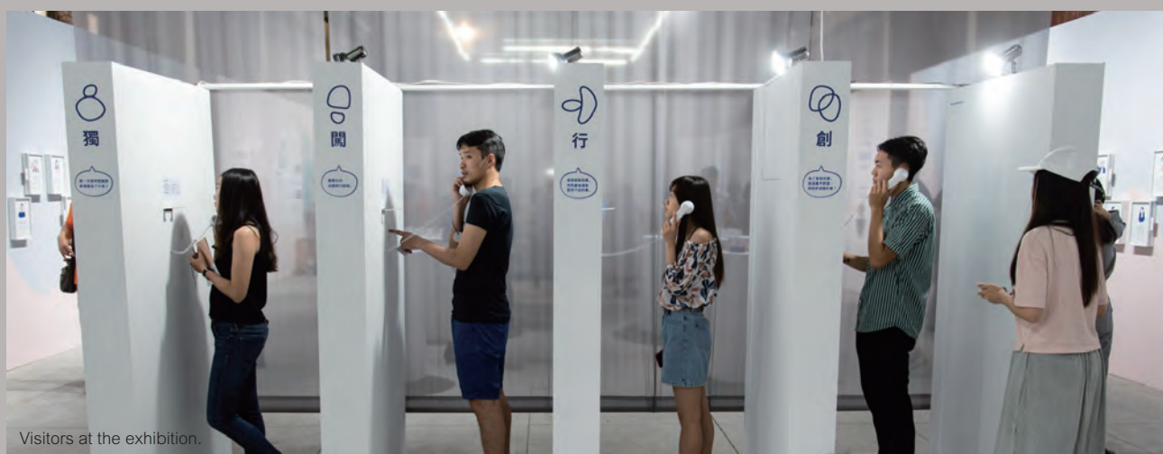
Visitors at the exhibition.

The 2019 Youth Out Expo was initiated by the Ministry of Education's YDA, organized by NTU D-School, and co-organized by ZA Share and Huashan 1914 Creative Park.