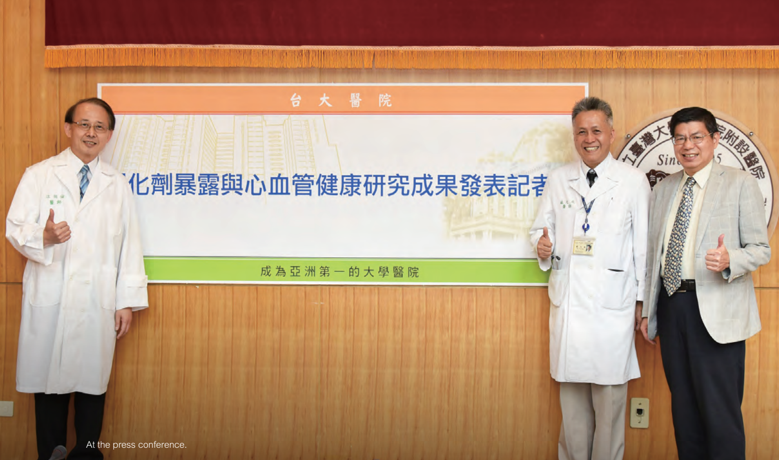
At the press conference.